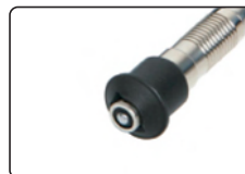
high-temp magnetic induction probe FH (OPTIONAL)