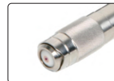
eddy current probe NM (OPTIONAL)