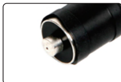
high-range magnetic induction probe FX (OPTIONAL)