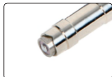
mid-range magnetic induction probe FL (OPTIONAL)